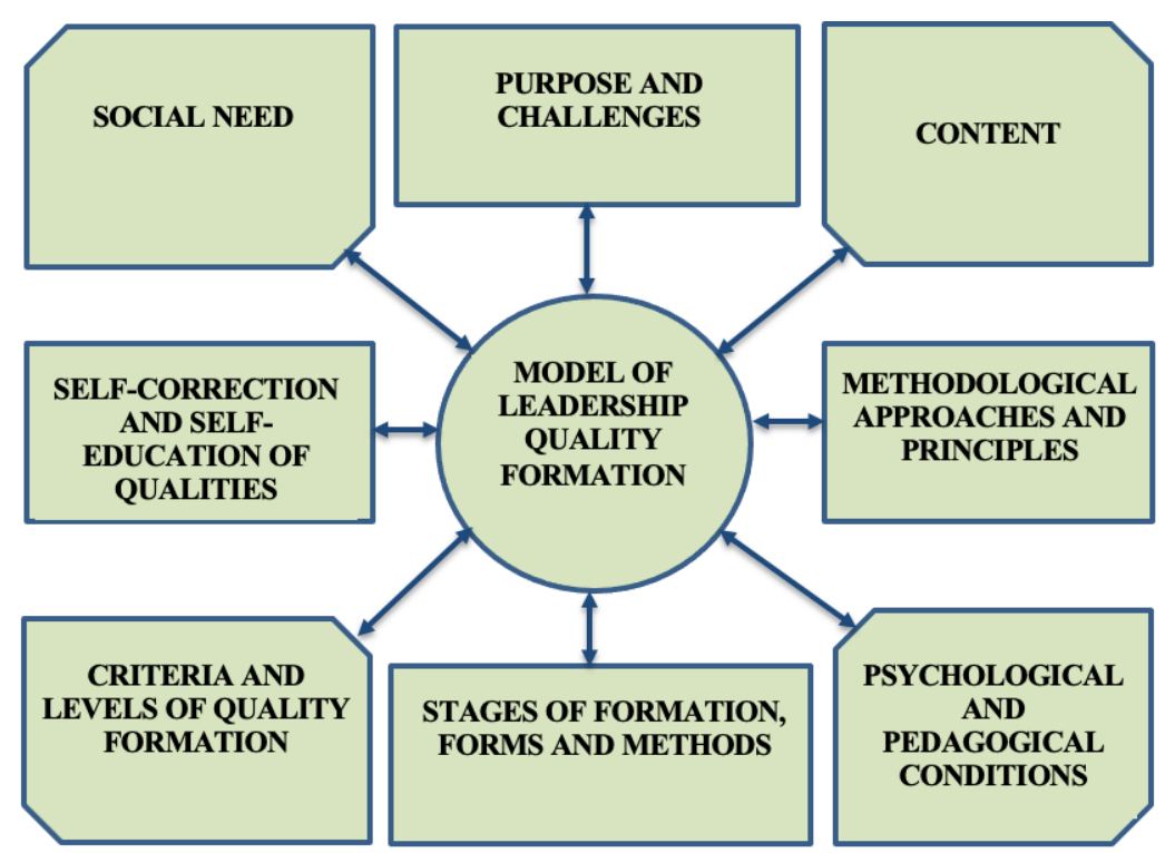
Figure 2. Model of formation of student leadership qualities.

interconnected components that determine its integrity and effectiveness.