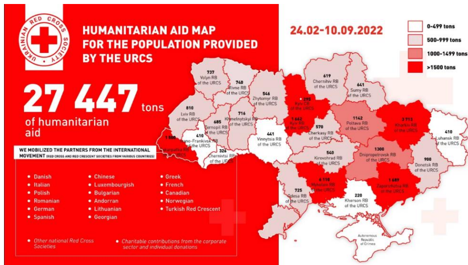
Figure 2. Humanitarian aid provided to Ukraine by the Red Cross Society

On the part of the Polish Red Cross, 332 vehicles and 3,048 tons of various types of humanitarian aid were provided.