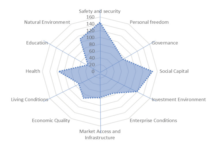
Figure 1. A Breakdown of the Performance of Ukrainian Prosperity, 2020

prosperity of their peoples, reflecting both economic, social, and political well-being. According to research by the Legatum Institute, the strengths of Ukraine are education (38<sup>th</sup> place) and living conditions (69<sup>th</sup> place), whereas its weaknesses are social capital, interpersonal trust, and trust in institutions (147<sup>th</sup> place), and personal security (144<sup>th</sup> place) (Figure 1).