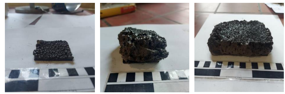
Figure 1 Samples of coated steel plates after testing

calculate the linear coefficient of swelling of the coating: K_1 = 0.5 (22.5 / 0.53 + 23.5 / 0.68) = 38.