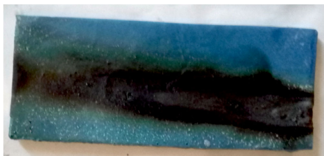
Fig. 3. The sample of the DGEBA/PEPA-CuSiF 6 after combustibility testing