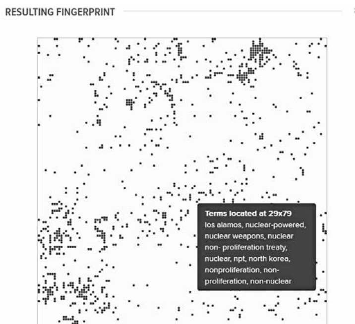
Fig. 2. Terms associated with full-scale invasion

are associated with full-scale invasion . Dots that are close to one another on the grid are also close in meaning.