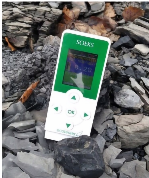
Figure 2. SOEKS environmental tester operation.