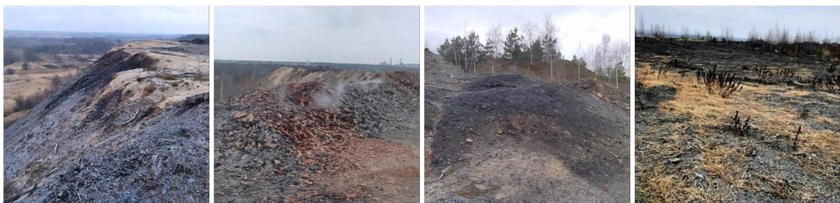
Figure 3. Results of burning certain areas of the waste heap at Nadiya mine

dose rate were observed near the burning areas of certain parts of the waste heap and amounted to 0.21, 0.25, 0.29 and 0.42 \mu\text{Sv/h} (figure 3). The lowest values were recorded in the forest area 3 km from the waste heap and near the man-made reservoir 2 km from the waste heap, which amounted to 0.12 and 0.17 \mu\text{Sv/h} .