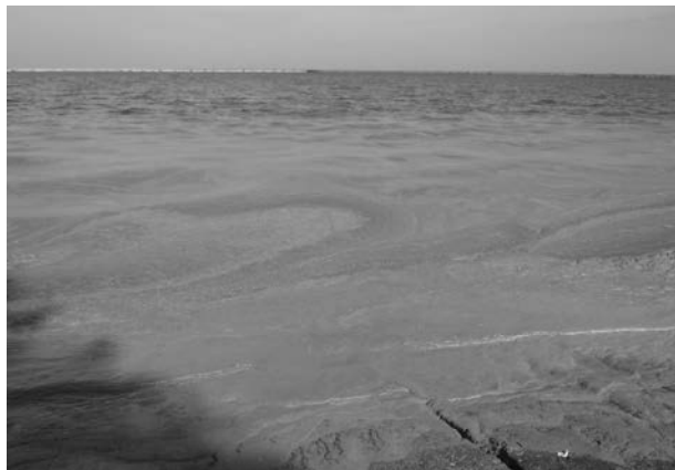
Fig. 1. The Accumulation of blue-green algae near Kremenchug hydroelectric station

The nature of the biological cycle of life and death of blue-green algae causes a dominant role in the ecosystem of the Dnieper. Since blue-green algae do not need the soil environment, their quantities are not affected by the depth of the reservoir. Therefore, under the influence of the wind blue-green algae (Fig. 2), migrate along the reservoir, which creates conditions for their progressive reproduction.