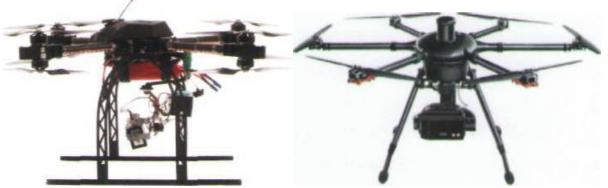
Fig. 2. Universal drones «ImiTec AARM»

The company has also developed a system of autonomous airborne radiation monitoring system that uses accessible and universal UAV «ImiTec RIAS» (Fig. 2). Airborne Advanced Radiation Monitoring (AARM) at low altitude provides radiation detection and can be adapted to regular monitoring of dangers radiation objects to respond to nuclear accidents or incidents related to the release of radioactive substances.