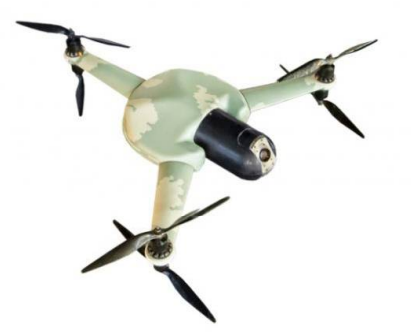
Fig. 1. General view of the Ukrainian unmanned aircraft «Viper SM 3»

Ukrainian unmanned aerial vehicle «Viper SM 3» is made in an unusual configuration, including rotor unit located on three separate consoles (Fig. 1), which improves the quality of maneuvering drones, providing it with good aerodynamics. Sizes of UAV «Viper SM 3» is quite compact - with length and width of the device 65 cm (without screws), its height is 20 cm, and provides drones weight 5 kg. Thus its load capacity is equal to its weight of 5 kg and at altitudes of up to 2 km. Radius of use UAVs to 6 km with a flight duration of 20 to 50 minutes depending on the workload of the unit.